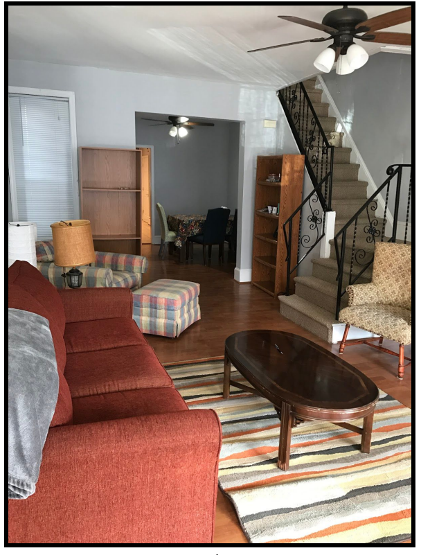
A Common Area in Locust House