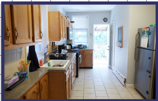
KITCHEN, FEATURING NEW APPLIANCES